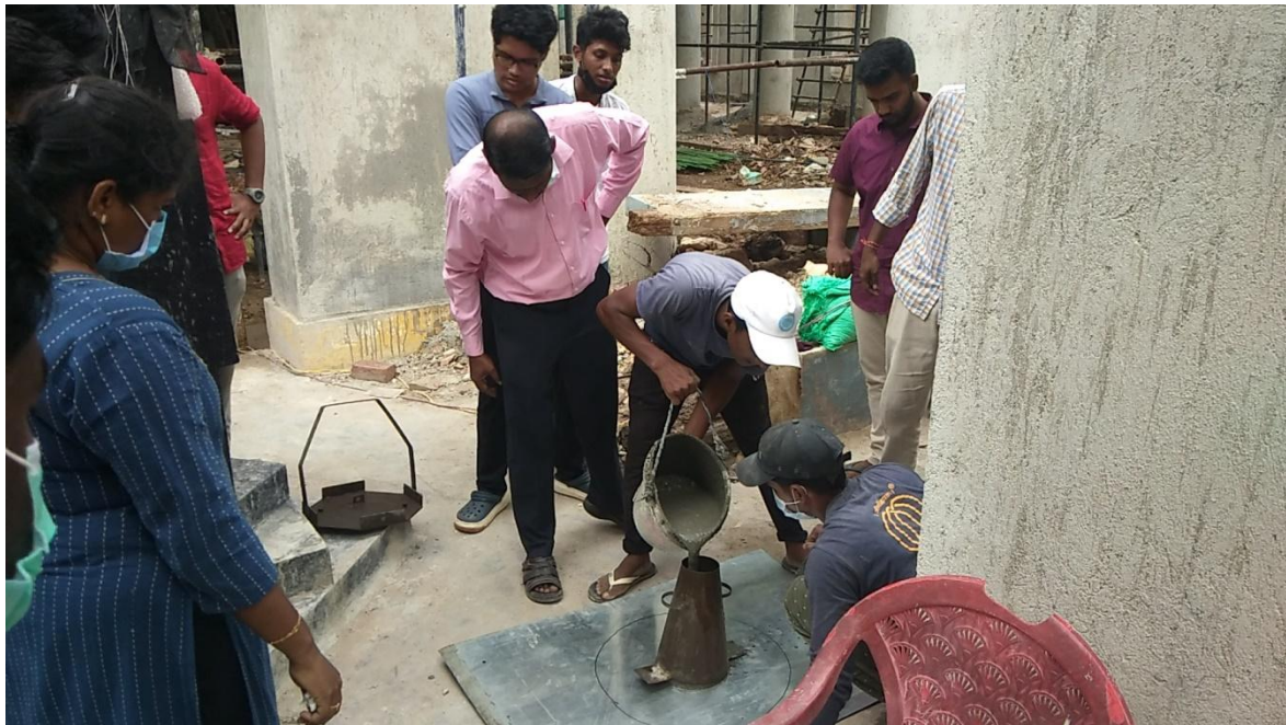
Field Visit of Student